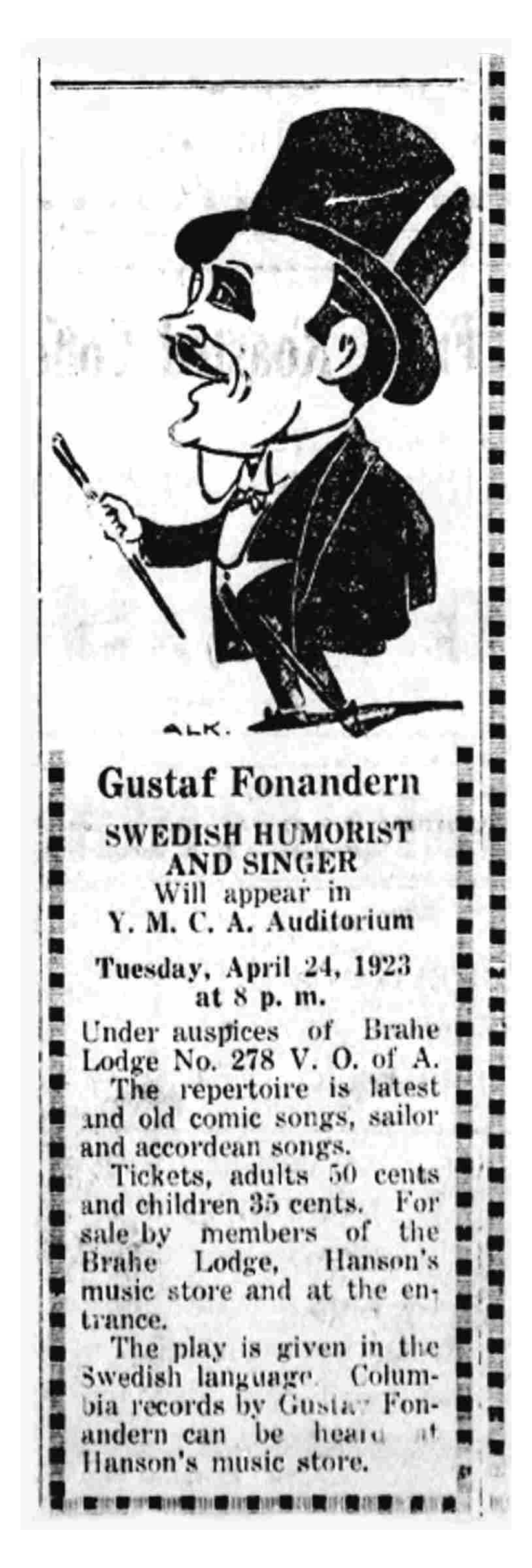
April 20, 1923 The Kane Republican, Kane, PA